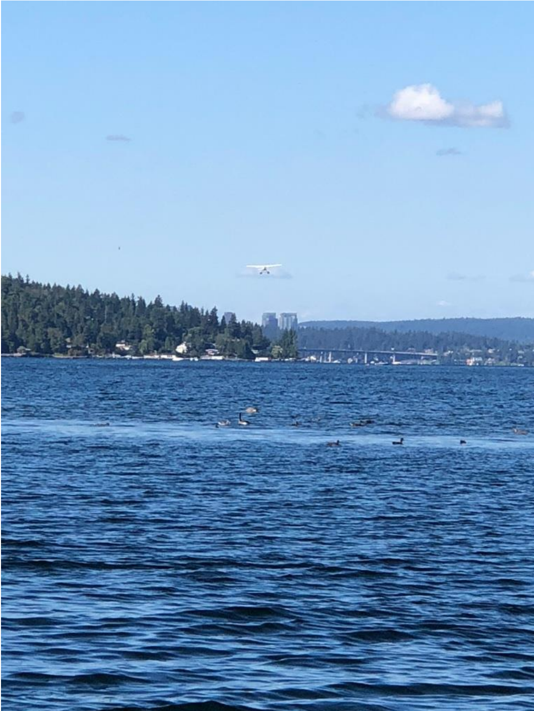
What your seaplane looks like when you sell it.